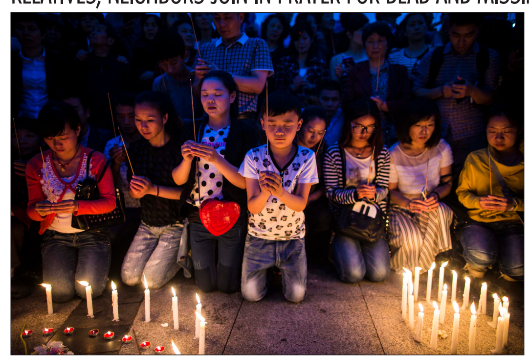
Prayers and a candle light vigil are conducted by residents of Jianli County and relatives of the ship's cabins one by one. missing and dead passengers aboard the capsized Eastern Star.

Xu said no further signs of life had been found and the chance of finding anyone else alive was "very