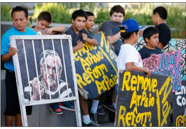
Protesters rally in front of Maricopa County Sheriff's Office Headquarters in Phoenix on Wednesday, May 25. A federal judge will hold a hearing Tuesday, May 31 to examine ways to address Sheriff Joe Arpaio's contempt-of-court violations in a racial profiling case.