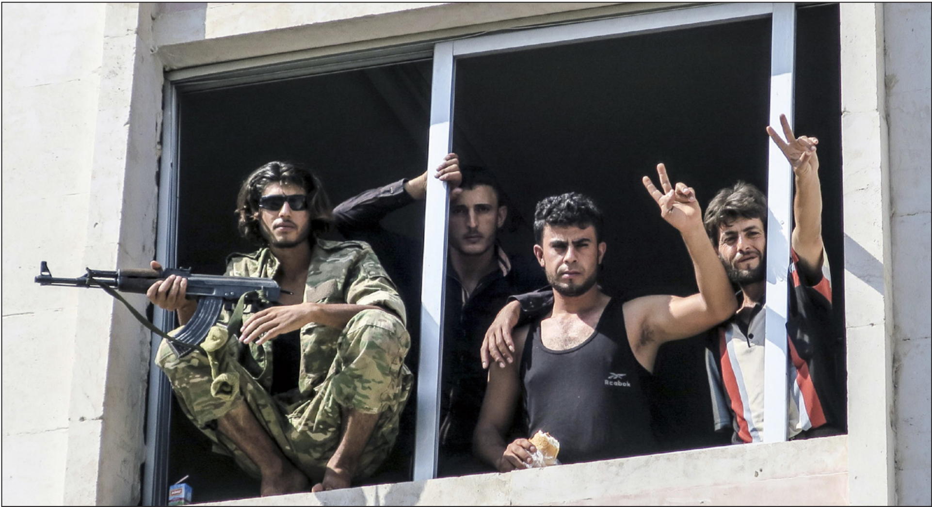
Free Syrian Army fighters give the victory sign in Jarablus, Syria. Veteran Syrian rebels who have fought Assad for years are struggling to find a place in a bewildering battlefield where several wars are all being waged at once by international powers. Battered by defeats, they bounce from alliance to alliance, feeling abandoned by the U.S. who they feel has given its support to Syrian Kurds. The rebels are faced with choosing whether to ally with Turkey or al-Qaida.